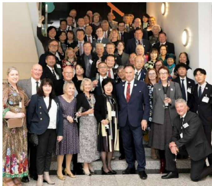
Guests for the civic dinner celebrating the 45 th Anniversary of the Dunedin and Otaru Sister City relationship at Tūhura Otago Museum in November 2024.