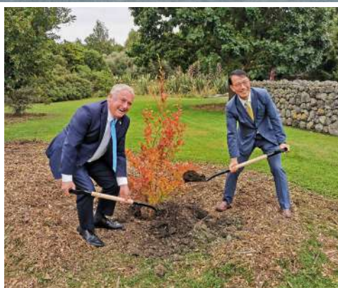
Right: Luncheon hosted by the Mayor at Canterbury Club