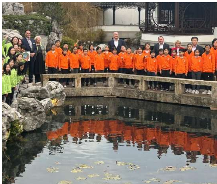
A performance by an 80-member youth choir from Shanghai at Lan Yuan to celebrate the 30 th Anniversary of the Sister City relationship was well attended.

Otaru gifted Dunedin a significant tree that were planted in the Otaru Teien at the Dunedin Botanic Garden. The Teien has been developed progressively by both cities since its opening in 1998.