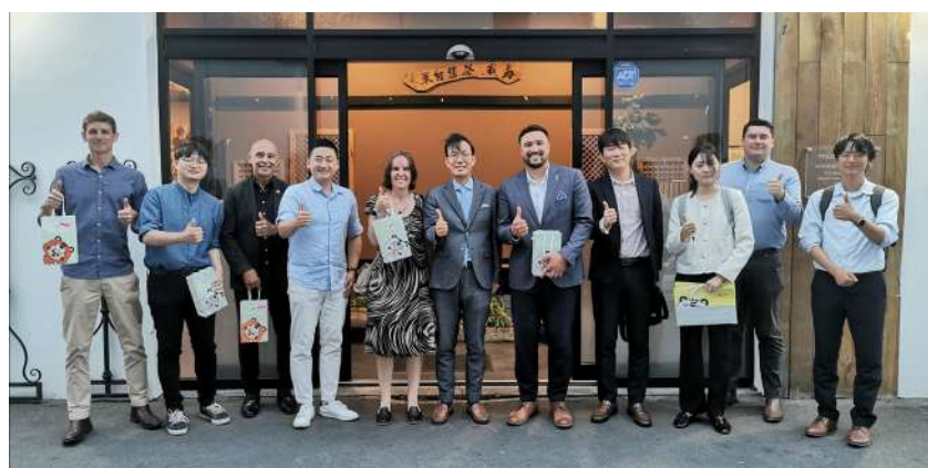
Below left: At the dinner hosted by CSSC Below right: Songpa Garden, by Songpa Pavilion