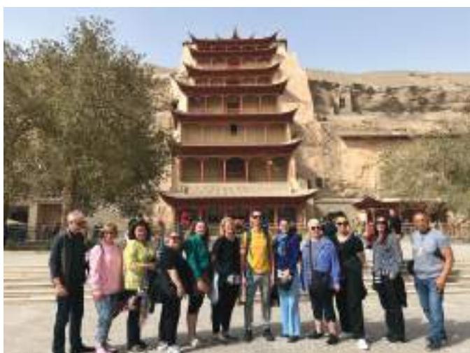
The delegation at the Mogao Caves in Dunhuang