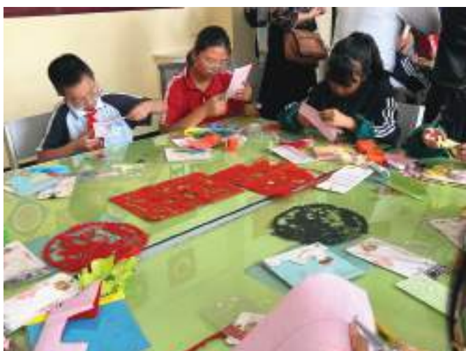
Paper cutting class in a Shandan primary school

All the delegation visited Qingquan School which is forging a relationship with Darfield Primary School. The other four Malvern primary schools, Springfield, Sheffield, Windwhistle and Greendale have also been paired with Sister Schools. There is huge disparity in size. The smallest Malvern School represented has 28 students; the Shandan primary schools had up to 3000 students each.