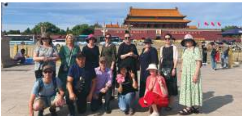
Tiananmen Square looking towards the Forbidden City