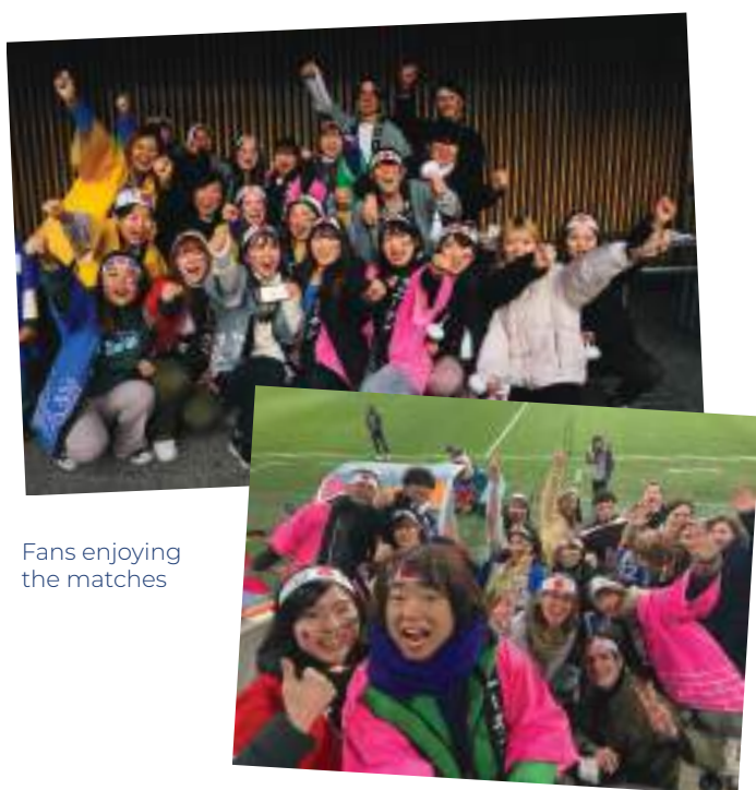
Fans enjoying the matches

The games have been a great chance to celebrate with people from around the world. We hope you've had a chance to enjoy the games too!