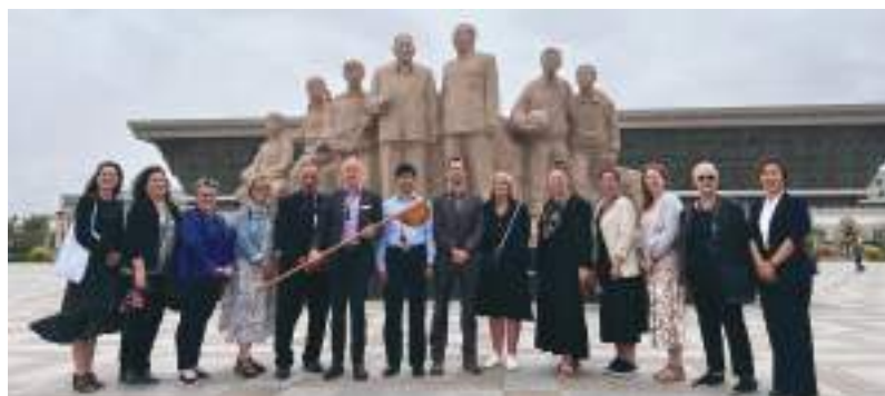
The sculpture of Rewi Alley and George Hogg outside Shandan Bailie Vocational College

A visit to Shandan No1 Middle School provides another opportunity for a Sister School in Selwyn.