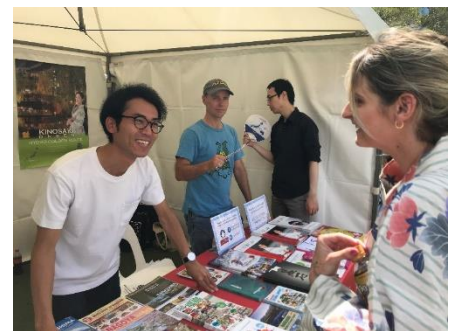
Perth Japan Festival 2020