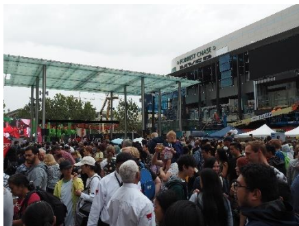
Perth Japan Festival 2019