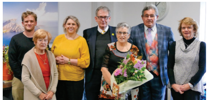
Whakatāne District Sister Cities Committee Members