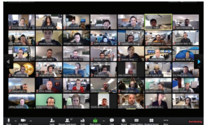
AGM Virtual Attendees