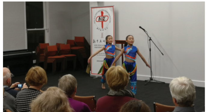
A performance from the Oriental Dance Academy