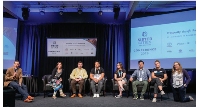
Kōrero Panel at SCNZ Conference 2019