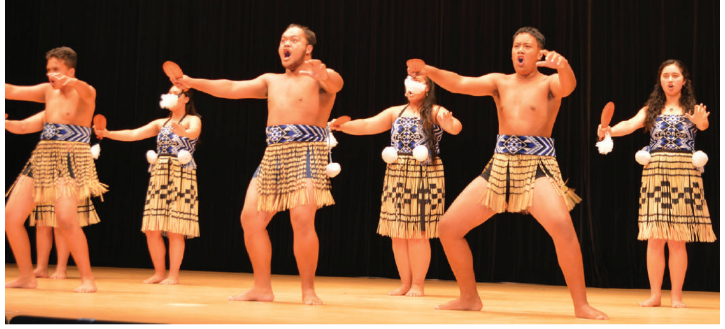
Trident High School Kapa Haka group

As usual when the bus came to take us to the next destination, there was many hugs, lots of smiles and even a few tears and friendships bonded before heading off to the next destination – Shibukawa. The trip was a success and a real testament to the objectives of the Whakatāne District Sister Cities Association.