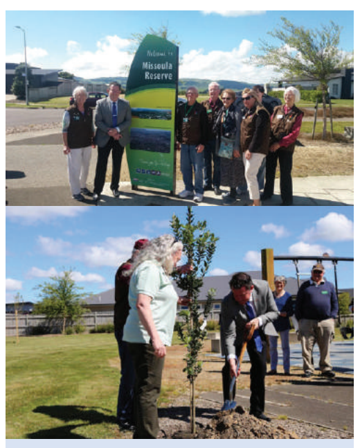
Top: The Mayor and Friendship Force visitors from Missoula stand at the entrance to Missoula Reserve, named for our US Sister City.

"It was a great opportunity for us to be able host the visitors in our city during the 35th anniversary," says